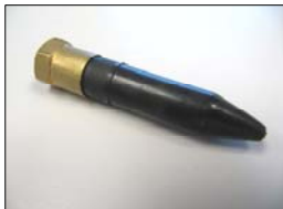
P/N: MABG (Air Blow Gun)

30 feet per packet. Used with Brass Barbed Fittings.