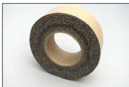
P/N: MRCT50 P/N: MRCT100 (Rubber Cork Tape)

Available in 50' & 100' length rolls. Used on same guiding applications to help reduce slippage between guide roller surface and web material. Please provide roll diameter and roll length when placing your order.