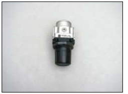
P/N: FRPAR (Precision Low Pressure Regulator)

Two piece set: (.1µ cartridge, .05µ coalescing)