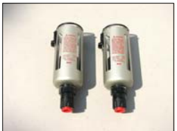
P/N: FRBD (Replacement Filter Bowls)

Two piece set replaces the steel filter bowls on P/N: FRGAC Automatic drains included.