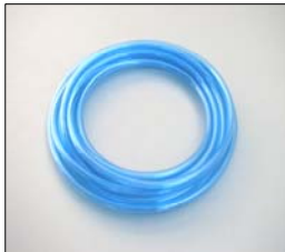
P/N: MAH25 (1/4" ID Polyurethane Air Hose)

30 feet per packet. Used with metal Push/Lock "one touch" Fittings.