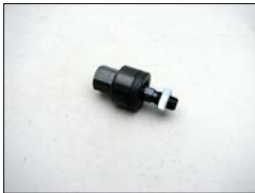
P/N: MRAC (Rod Alignment Coupler)