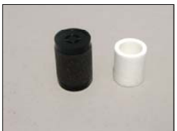
P/N: FRC2S (Replacement Cartridges for P/N: FRGAC)

Two piece set replaces the steel filter bowls on P/N: FRGAC Automatic drains included.