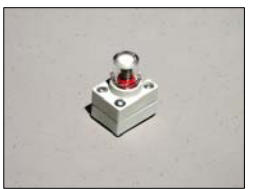
P/N: FRPUI (Replacement Pop-Up Indicator)

Indicates air restriction due to contamination. For filter sets with this capability