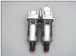
P/N: F2SA (Two-Stage Filter bowl assembly with pop-up indicator and automatic drains)