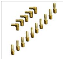
P/N: MBFCS (Brass Barbed Fittings for One Complete System)