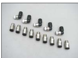
P/N: MFCS (Push/Lock Fittings for one Complete System)