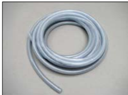
P/N: MAH38 (3/8" ID Braided Air Hose)

30 feet per packet. Used with metal Push/Lock "one touch" Fittings.