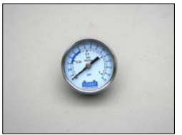
P/N: FAG15 (Precision Air Gauge)