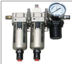
P/N: FRGAC (Two-Stage Filter, Regulator & Gauge Assembly)